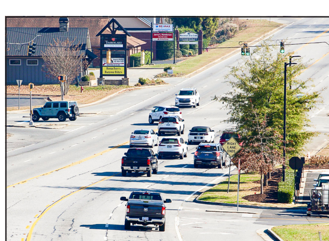
The only time traffic isn't congested on Georgia 515 through Blairsville is later in the evening or on a Sunday, as pictured