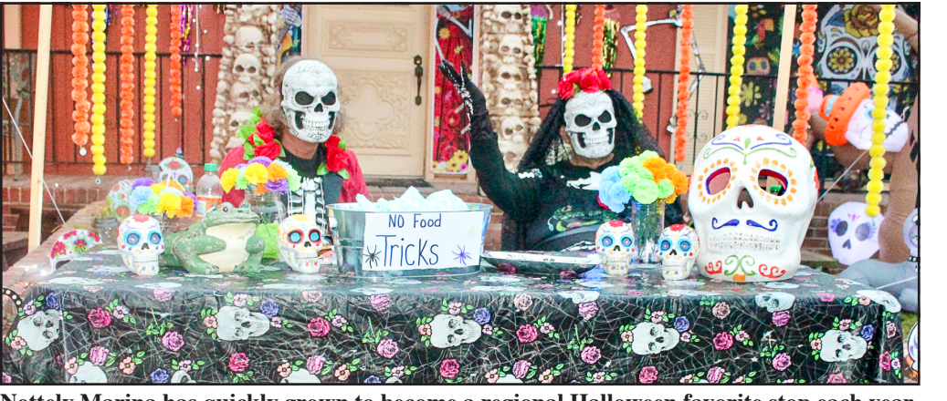
Nottely Marina has quickly grown to become a regional Halloween favorite stop each year.

form of unique costumes. Mark those calendars to attend Halloween at the Nottely Marina and the Blairsville Boo Bash next fall, and keep an eye out for the multiple Fall Festivals made available by area churches to offer families even more opportunities to take part in family-friendly community events.